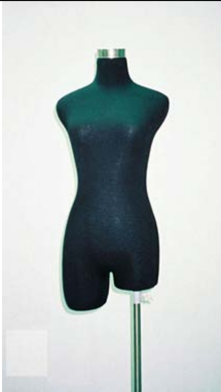
Item MS002. Bust with stand – Female Body, Black Color 半身模特兒連企座 – 女身，黑色