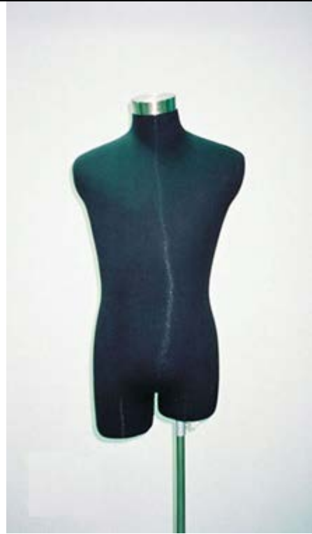
Item MS001. Bust with stand – Male Body, Black Color 半身模特兒連企座 – 男身，黑色