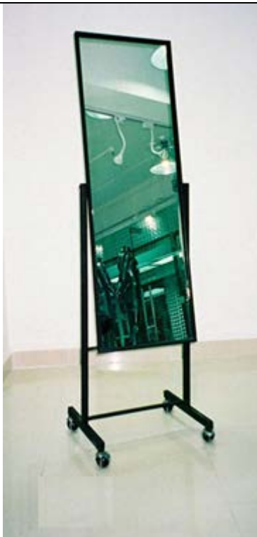
Item MS005. Movable Mirror 活動企身鏡